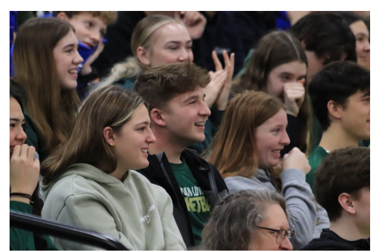
Crusader students, enjoying the National Lutheran Schools Week festivities