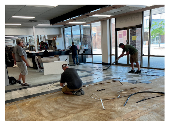
Many volunteers invested countless hours to accomplish the renovation project on time and within budget.

"It looks like a brand new store. I love the bright new look!" That's what customers and volunteers alike are saying about the newly renovated Neat Repeats Store. Located on Eastern Avenue in Plymouth, Neat Repeats is a thrift store that has supported Sheboygan Lutheran High School since it opened in June of 2009. After exploring the possibility of moving into a portion of the vacant K-Mart store, the Neat Repeats Board of Directors decided to sign a new 10-year lease to remain in its present location.