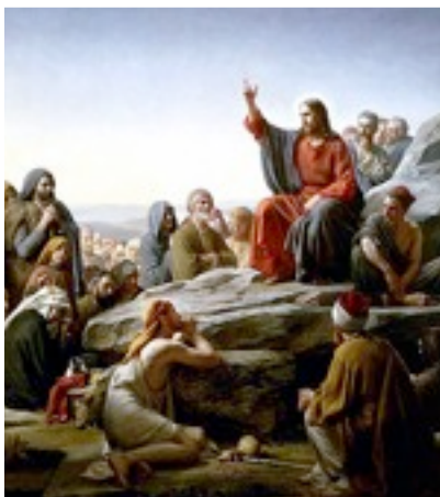
The Sermon on the Mount Artist Carl Heinrich Bloch

As I was overlooking the Virginia landscape from Monticello, I could not help think of John Winthrop's famous sermon he gave in 1630 entitled, "A Model of Christian Charity." In this sermon, Winthrop proclaimed that the Massachusetts Bay Colony and their new community would be "a city on a hill" to be watched and emulated by all the world. President's John F. Kennedy and Ronald Reagan would later use the "city on a hill" saying and imagery to paint a vision of American exceptionalism.