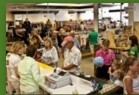
Neat Repeats pg. 6