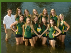
Leader Board pg. 2