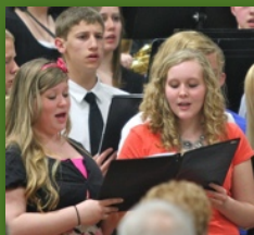
From the Podium pg. 3