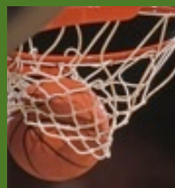
A.D. Notes pg. 5