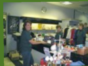
Neat Repeats pg. 6