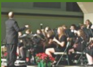
From the Podium pg. 3