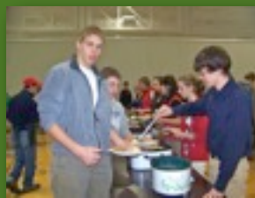
Student Council pg. 5