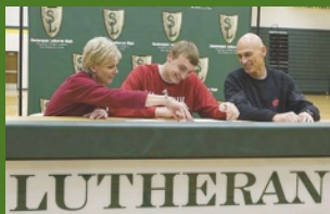
Leader Board pg. 2