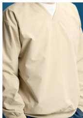
Windshirt Fleece Blanket