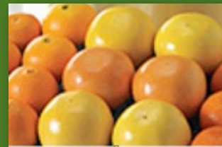
Citrus Sale pg. 6

“Preparing Christian Leaders - One Student at a Time”