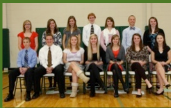
NHS pg. 5