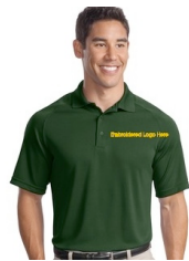
Men's Polo Gym Bag