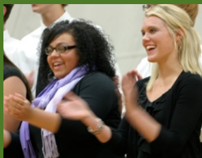
From the Podium pg. 3