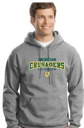
Sweatshirts Long/Short Sleeve

A sincere THANK YOU for your past cooperation and with your assistance and support, we look forward to another successful CITRUS FRUIT SALE.