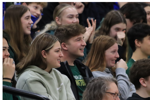
Crusader students, enjoying the National Lutheran Schools Week festivities

Check out this great video by St. Paul's Lutheran Church in Sheboygan Falls, highlighting the Lutheran Schools in Sheboygan County!