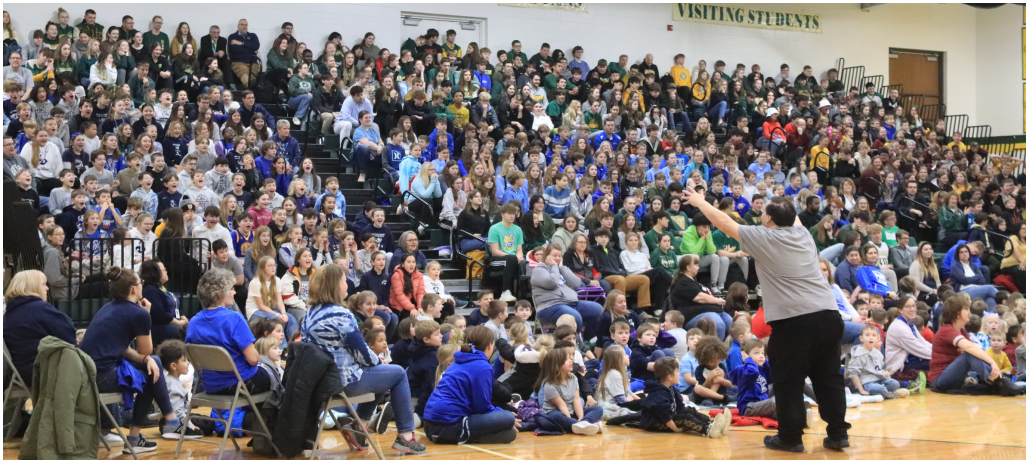
LHS hosted students and staff from Bethlehem, St. Paul Sheboygan, St. John Plymouth, St. John Random Lake, and Trinity for improv entertainment during National Lutheran Schools Week 2024.

Lutheran schools - a gift that is so easy for us to take for granted simply because they are so abundant in our midst. Did you know there are only 103 Lutheran high schools in the U.S., in 31 states? That means 19 states do not have even ONE Lutheran high school. What a blessing to have Sheboygan Lutheran High right here, in our very own backyard, not to mention FIVE wonderful Lutheran elementary schools in Sheboygan County.