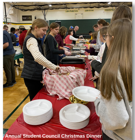
Annual Student Council Christmas Dinner