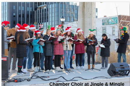
Chamber Choir at Jingle & Mingle

For more information about Neat Repeats, visit www.neatrepeats thriftshop.com . Let's make it another banner year!