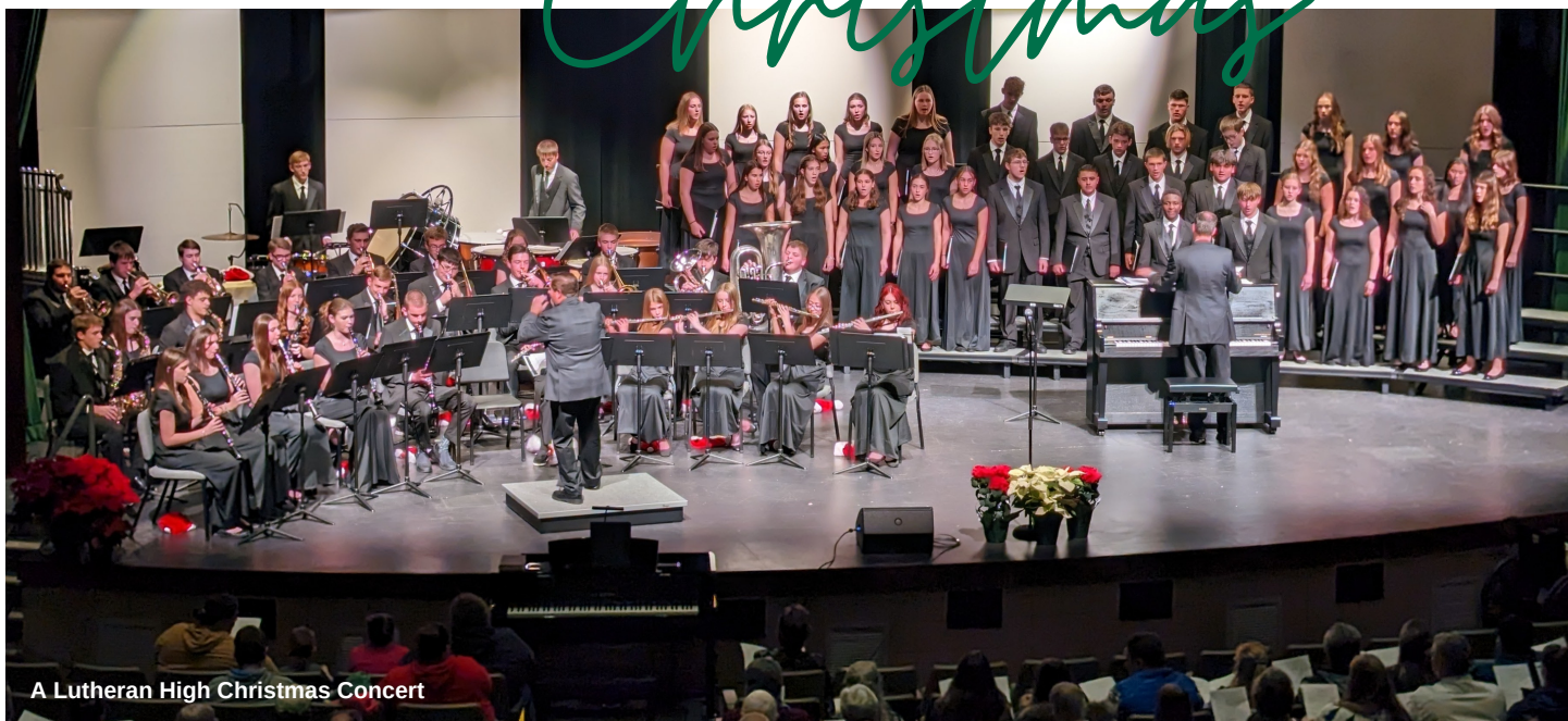
A Lutheran High Christmas Concert

December is inevitably a busy, stressful month with jam-packed schedules, additional commitments, and, of course, final exams. But the staff and students of LHS did their best to make spirits bright around the halls and in the community.