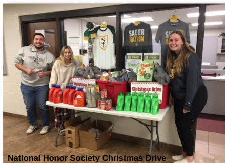
National Honor Society Christmas Drive