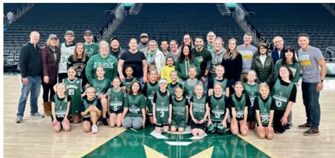
The 2022-2023 Jr. Crusader girls' teams at Fiserv Forum to cheer on the Milwaukee Bucks

To this list, we can add the category of Junior Crusaders. The Junior Crusader program combines instruction of athletic skills, sportsmanship, and team play with developing a sense of belonging to the Lutheran High School family from a young age forward (typically 3rd-8th grades). This program has had a profound impact on our young people's lives, on the development of "team," on the strengthening of their faith, on the development of young Christian leaders, on the building of the LHS athletic program, and not the least, on Sheboygan Lutheran's enrollment effort.