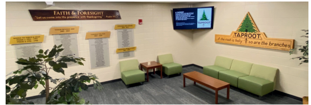
As part of decorating the new hallway space between the buildings, we redesigned the donor boards of every LHS capital campaign onto modern opaque glass boards, created a slideshow of the Taproot Club membership to a digital monitor, and designed a wall of our history using photos and groundbreaking shovels from each campus construction.