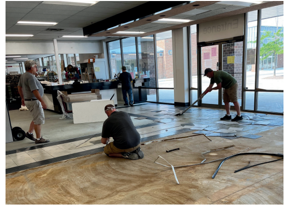
Many volunteers invested countless hours to accomplish the renovation project on time and within budget.

“It looks like a brand new store. I love the bright new look!” That’s what customers and volunteers alike are saying about the newly renovated Neat Repeats Store. Located on Eastern Avenue in Plymouth, Neat Repeats is a thrift store that has supported Sheboygan Lutheran High School since it opened in June of 2009. After exploring the possibility of moving into a portion of the vacant K-Mart store, the Neat Repeats Board of Directors decided to sign a new 10-year lease to remain in its present location.