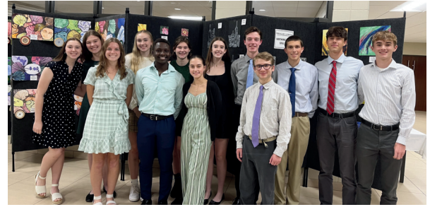
Student performers and speakers at the 2023 Taproot Club Dinner

Even if you missed the October event, it's not too late to join the club! Donations to the Taproot Club are accepted year-round as they provide needed funds to our daily operations.