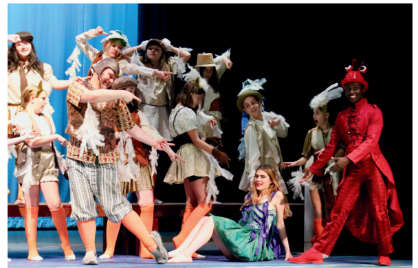
The Performing Arts Center is put to use year-round for musical and drama productions, worship services, and events by Lutheran High, our friends in the Sheboygan Area Lutheran Schools Association (SALSA), and community organizations. [Above] The 2023 LHS Spring Musical, The Little Mermaid [Below] The 2023 Together in Harmony Fall Sampler Concert

With more funding needed to retire our loan before interest rates increase in 2026, we are in debt-reduction mode to position LHS on a solid financial path as we approach our 50th anniversary. The guiding verse for the campaign is from Psalm 145:4: "One generation shall commend your works to another, and shall declare your mighty acts." While we give thanks for and celebrate our current Crusader student body, preparation for the next generation of Christian leaders starts now. The success of this campaign significantly impacts the future of Sheboygan Lutheran High School.