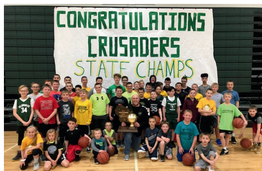
Throwback to the Jr. Crusaders celebrating the 2019 boys' state championship