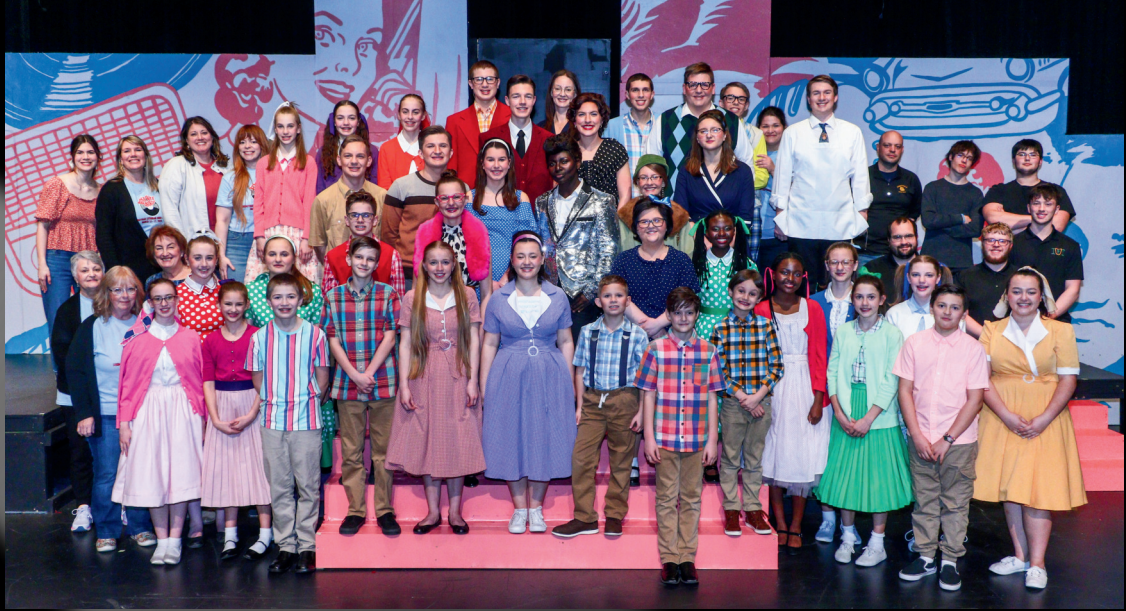
The Cast & Crew of the LHS Spring Musical, Bye Bye Birdie

From athletics to academics, fine arts to clubs, there are so many ways to let your light shine at LHS! Check out these Crusaders who have been crushing it this school year, using their God-given talents to His glory.